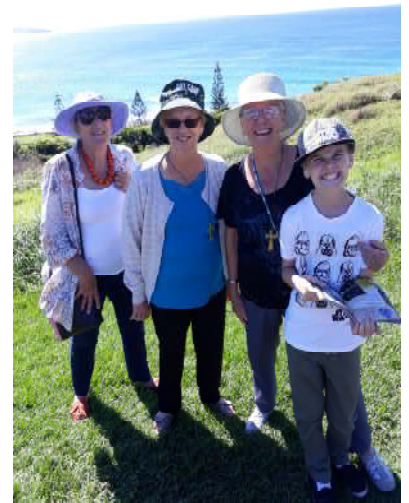
Family Camp Ramble